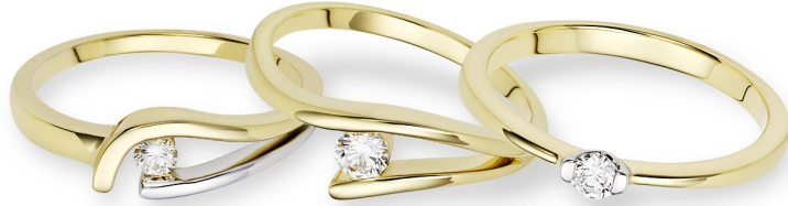
8 9 10